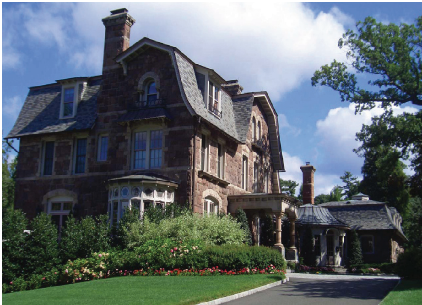
Front view of the Straus home

“It all turned out so well that I wouldn’t change a thing if I could.”