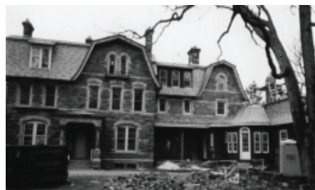
Renovation in progress