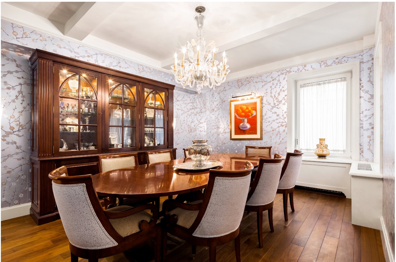
Agostino dining table, custom made breakfront, Decoratif window treatments throughout