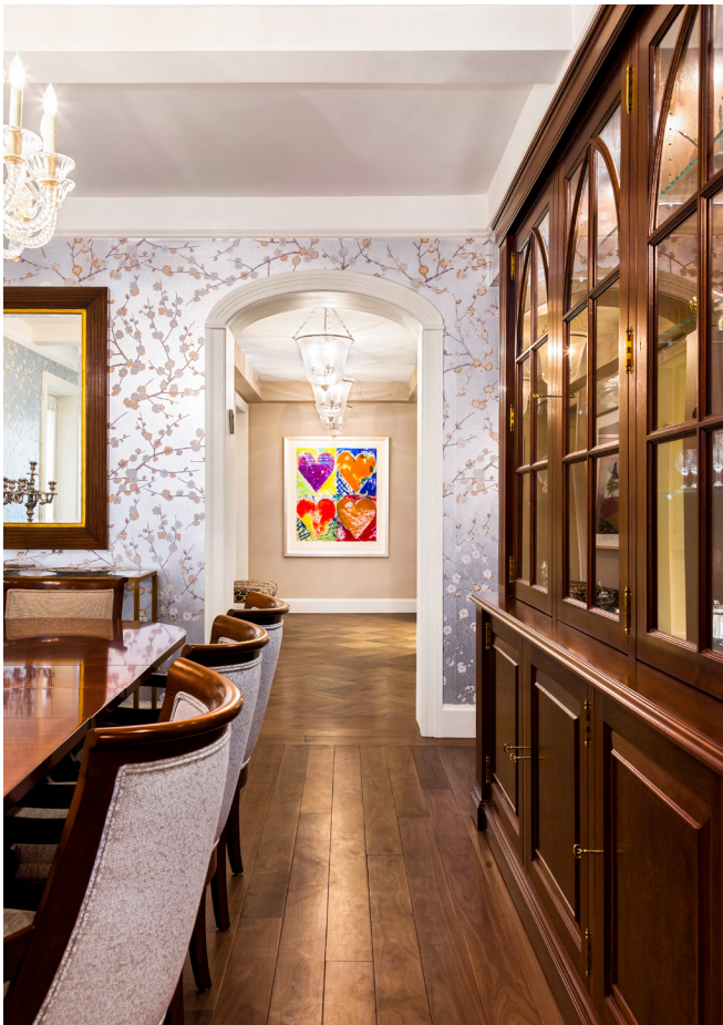
Paul Ferrante mirror, LV Wood custom walnut flooring