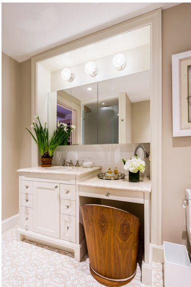
Her bath with make up section, Artistic Tile flooring