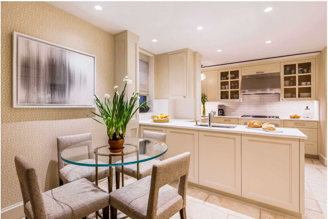
Custom kitchen LOID built by Bennett Cabinets