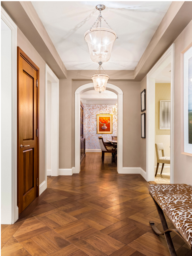
Vaughan Lighting lanterns

And, it was quite the achievement: the apartment was transformed from three bedrooms into one, galleries and hallways redefined, kitchen and dining room turned into both workable and luxurious spaces. All in all, the redo saw the creation of: