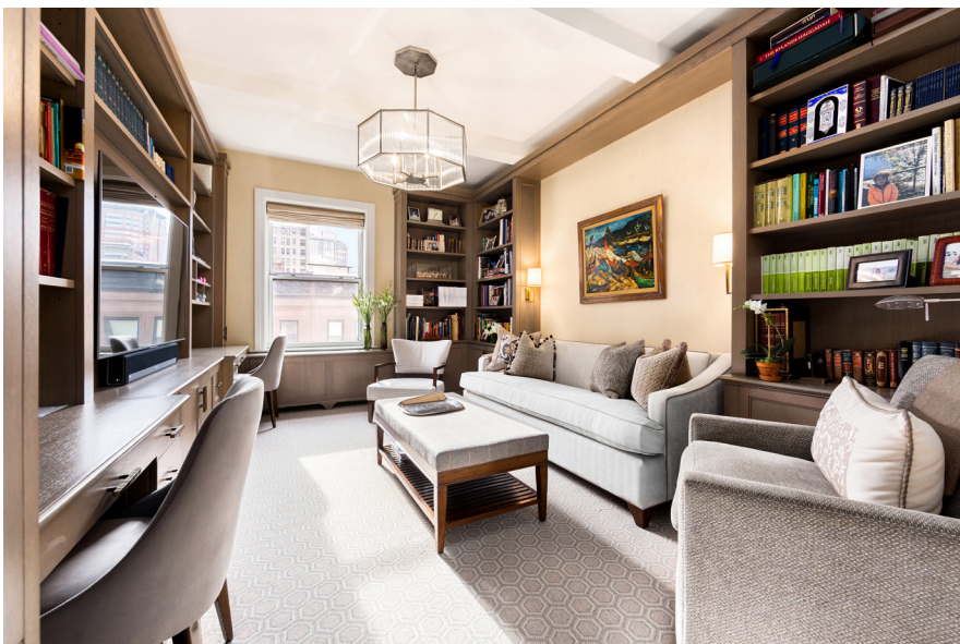
Artistic Frame desk chairs, Arudin Lounge chair and table