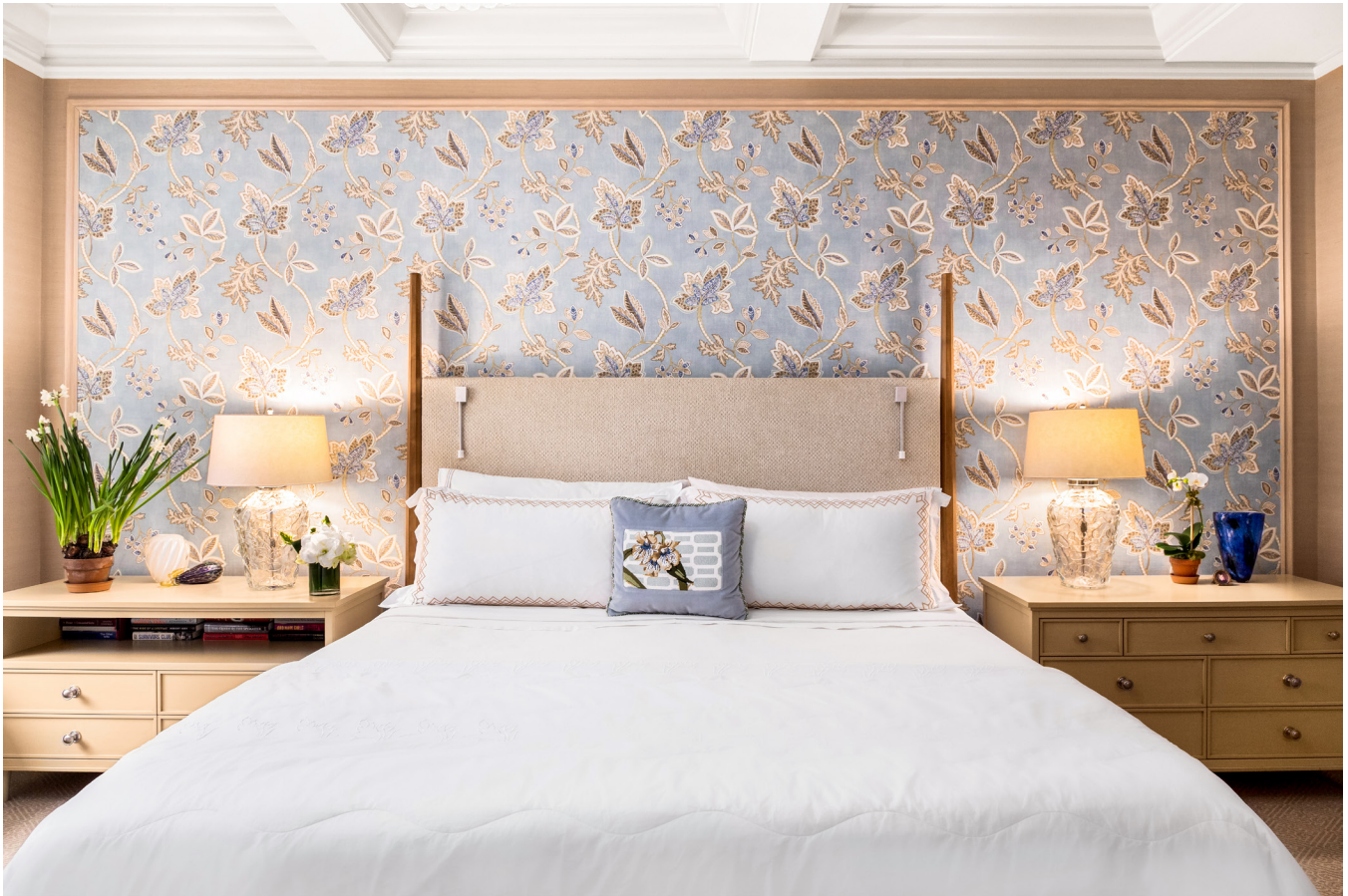
Paper backed floral fabric Cowtan & Tout, custom design bed + chests