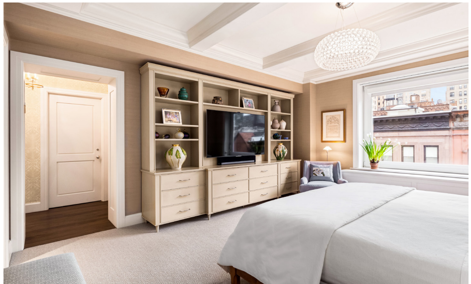
Phillip Jeffries grasscloth walls, custom dresser/shelving piece