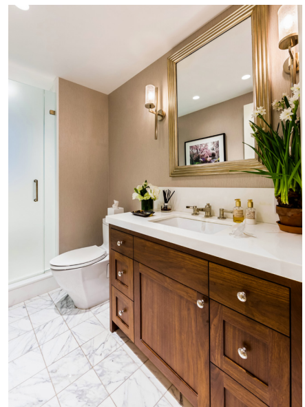
Custom design walnut vanity and silver leaf mirror