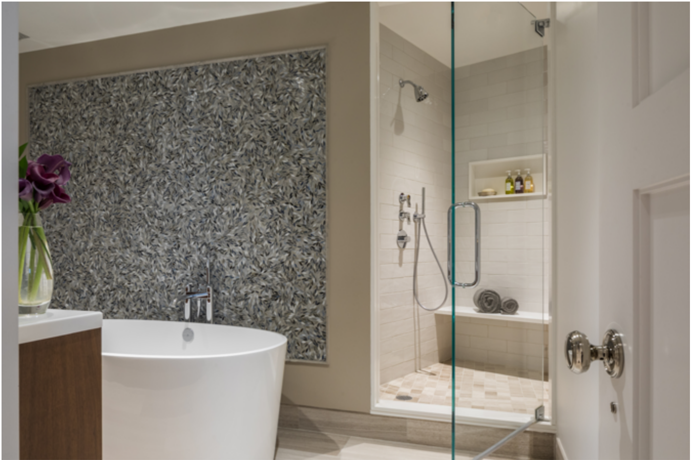
View of the master bath walk-in shower, steeping tub, walnut vanity., and mosaic wall tile by Artistic Tile.

The design group figured out ways to make the space work. We came up with a plan that held 5 ½ bathroom's, 4-5 bedrooms, housekeeper's quarters, and public living spaces. All told there are: A master suite with sitting room, two offices, two terraces, large bathroom and walk-in closets. Three children's bedrooms with two baths. A housekeeper's bedroom and bath, adjacent to a large laundry room. An open concept living room/dining room. Large eat-in kitchen, butler's pantry, family room, and full bath. Wrap around terraces in public spaces.