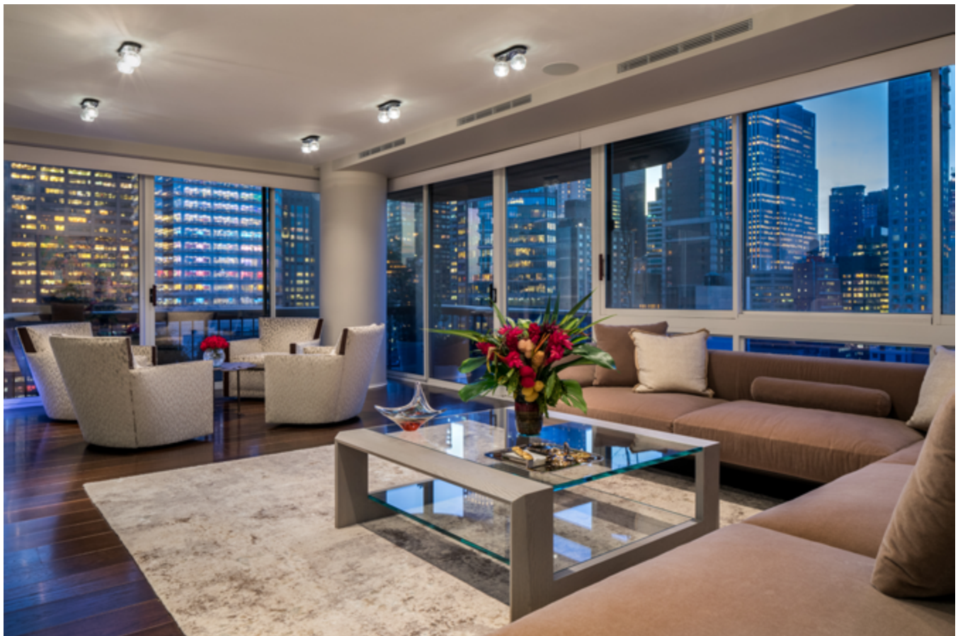
View of Living Room. Hellman-Chang coffee table. Stark Carpet area rug