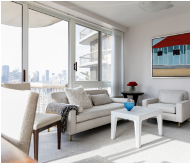
View of HER office sitting area

Q. What pleases the family most as well as you?