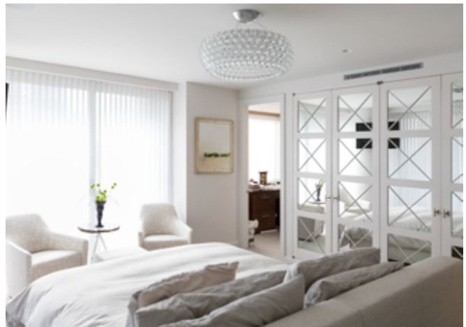
Master bedroom showing closets for shoes and handbags. View into HIS office beyond.