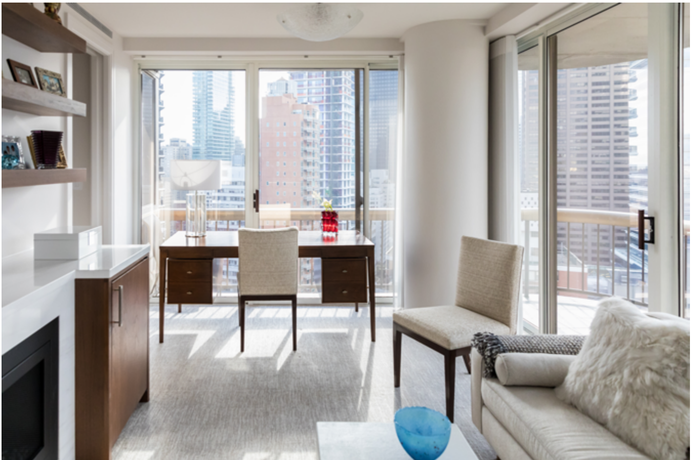
View of HER home office within the master suite. Wrap around terrace, custom cabinetry with fireplace and refrigerator. Quintas walnut desk. The two chairs in this room are additional dining room chairs.